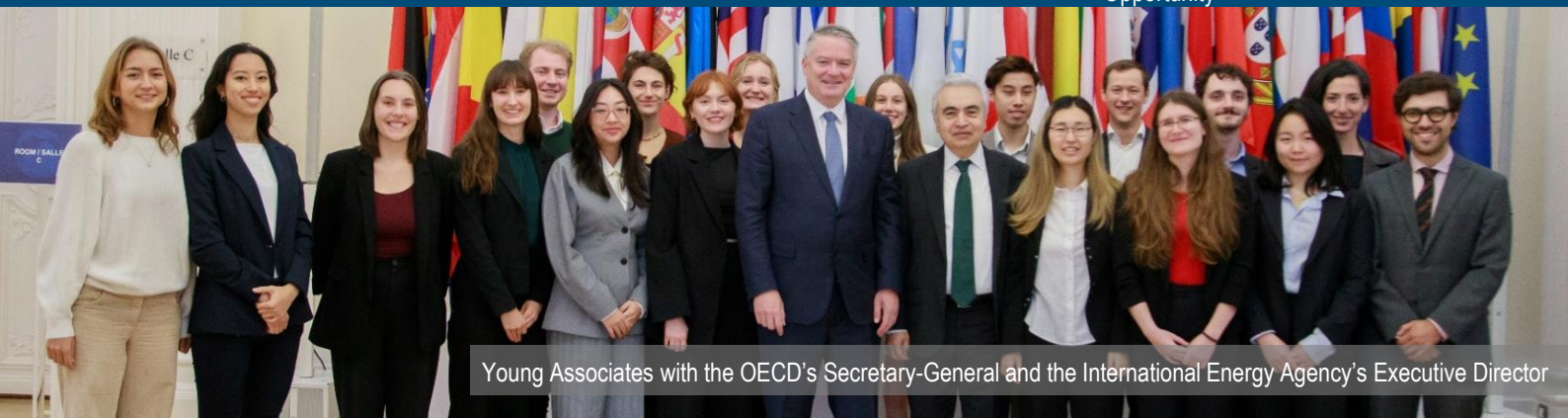
Young Associates with the OECD's Secretary-General and the International Energy Agency's Executive Director

During the two-year Programme, YAs are closely mentored by their managers to develop their substantive expertise and support their integration into the wider Division and Directorate.